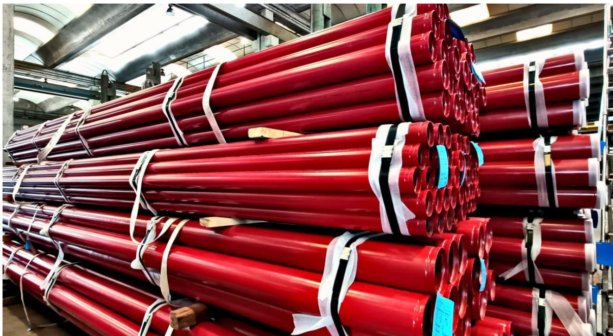
Figure 1: visual representation of the product

41285 - Line pipe of a kind used for oil or gas pipelines, welded, of steel